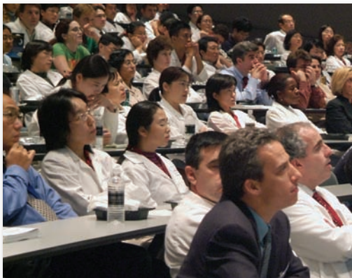
M. D. Anderson Grand Rounds