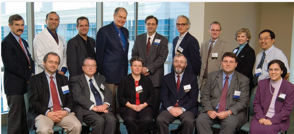
Speakers and Steering Committee Members

Kettering Cancer Center was selected as the site for the 2007 Biannual Infections in Cancer Symposium.