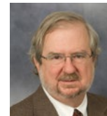
PROFESSOR AND CHAIR James P. Allison, Ph.D.*