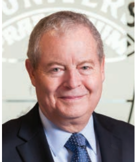
James J. Mulva Chair

The MD Anderson Cancer Center Board of Visitors is an appointed board of people committed to helping MD Anderson achieve its mission of eliminating cancer. Board programs emphasize private fund development, public relations and outreach on behalf of the institution.