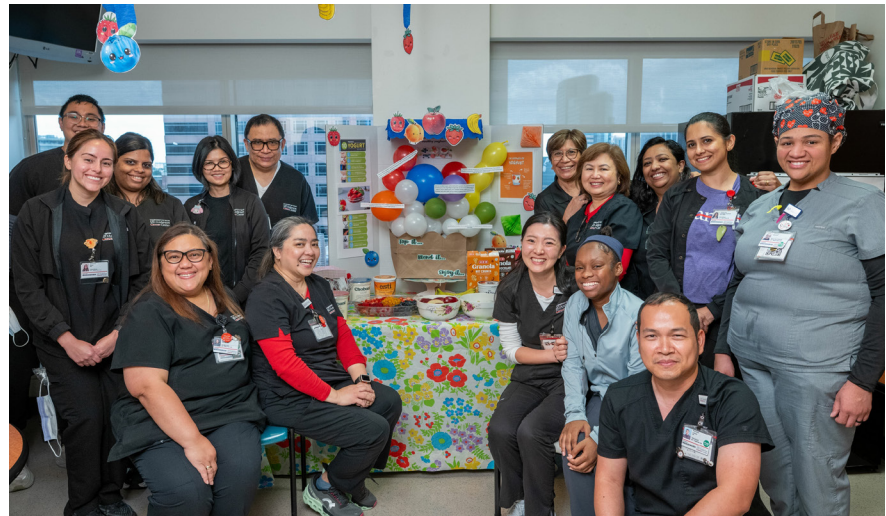
Nurses in the Main Building ATC take part in a Wellness Wednesday, exploring the nutritional benefits of yogurt and discovering creative, healthy topping combinations.

Participation has steadily increased, with staff reporting reduced stress, improved morale and stronger team connections. The initiative also led to