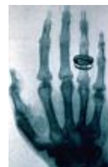
Early X-ray image